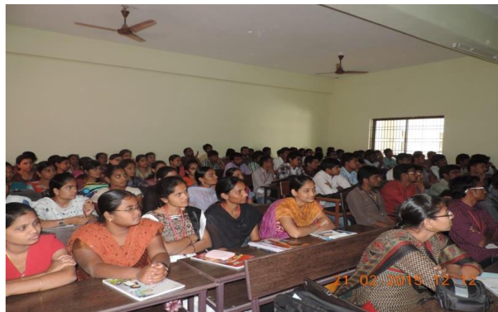
Guest Lecture on 02-03-2015