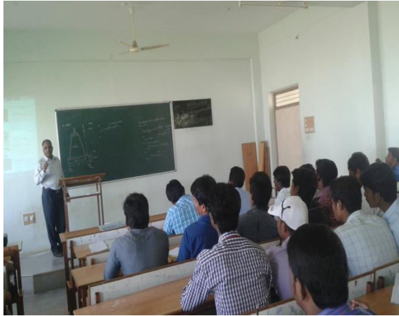
Guest Lecture on 03/02/2015