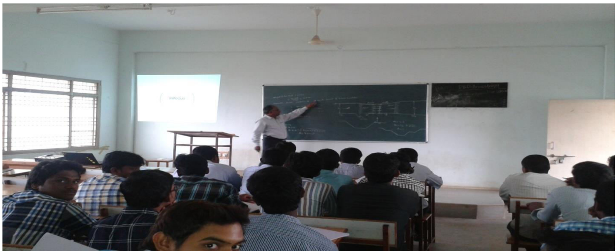
Guest Lecture on 04-04-2015