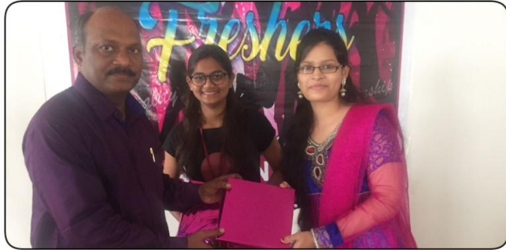
SNAPSHOTS OF THE EVENT AND PRIZE DISTRIBUTION