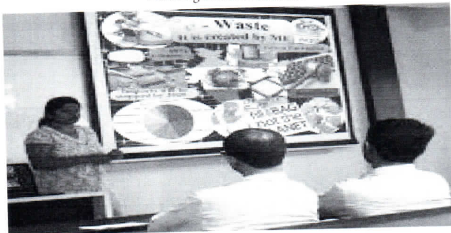
POSTER PRESENTATION BY STUDENTS