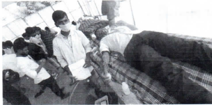
MEGA BLOOD DONATION CAMP