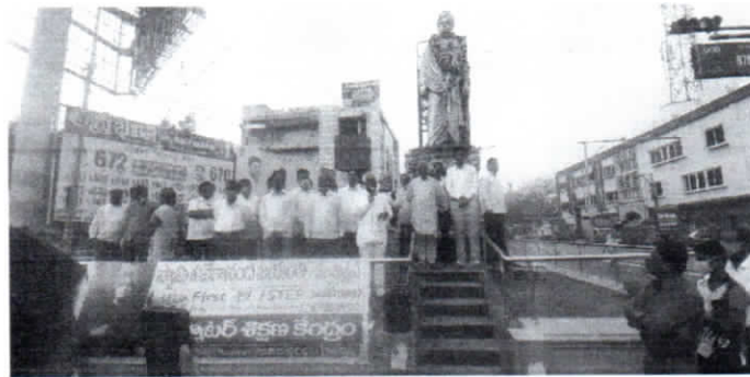
NATIONAL YOUTH DAY