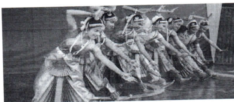
Orientation Day Celebrations- Welcome Dance