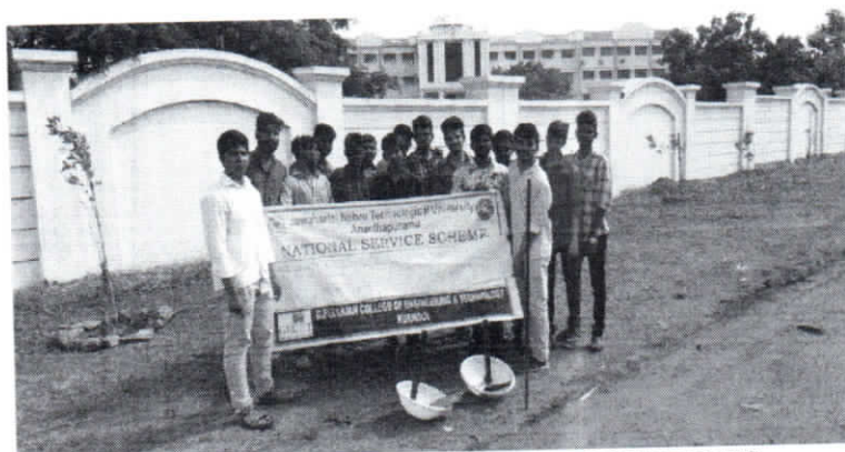
NATIONAL SERVICE SCHEME BY STUDENTS